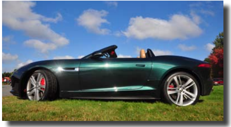
David's F-Type.