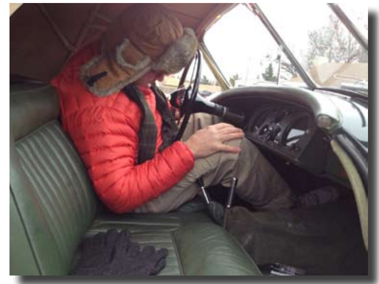
(It turned out that we did not make many meal stops on the trip because we were trying to log enough miles to stay ahead ability to drive the XK120. And that shifter in his thigh looks painful of the storm chaosing us.) My only ontry in lon's blog was ofter too.

We soon found our way to a good looking breakfast spot. (It turned out that we did not make many meal stops on the